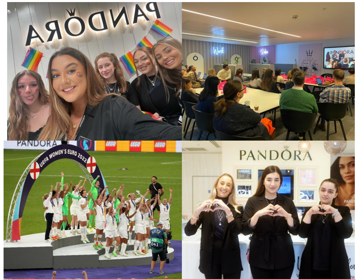
From top left, clockwise: (1)Pride celebrations in store,(2) International Women's Day panel discussion, (3) Women's UEFA tournament, sponsored by Pandora, (4) Pandora store teams

Our figures are calculated based on the proportion of male and female employees in four pay bands and includes data on the number of employees, employment statuses, pay information, data on bonuses, hourly pay and the data on working hours.